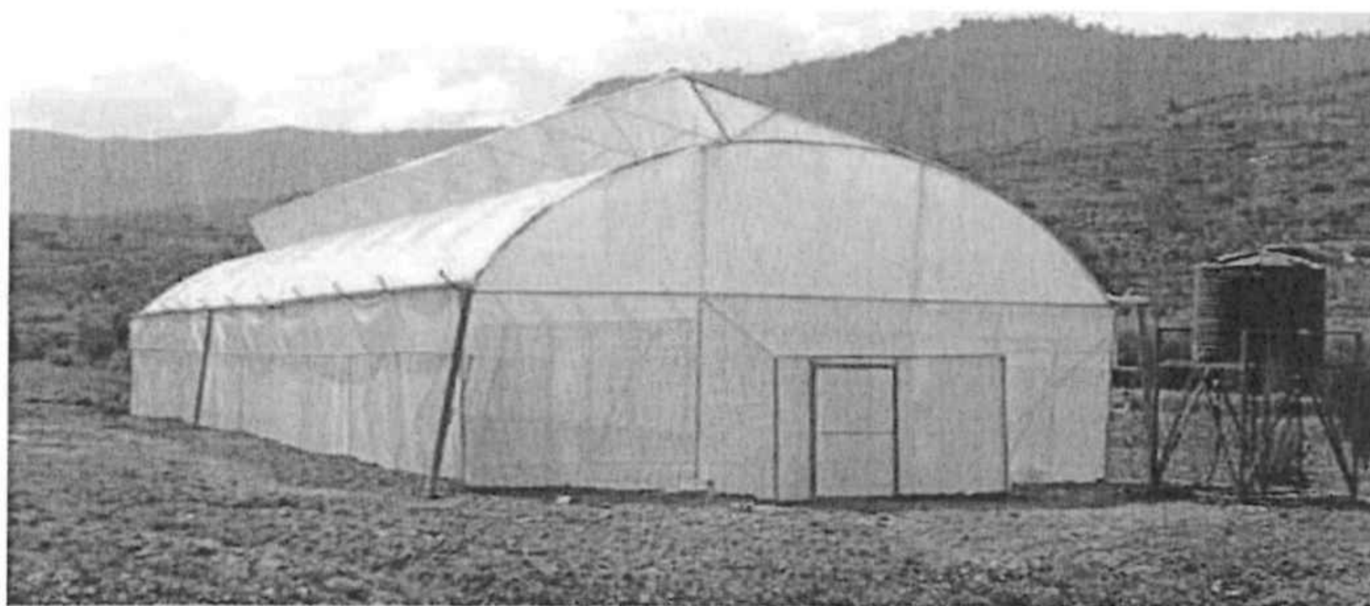
Picture: 8MX30M installed greenhouses